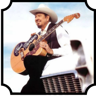
Hank Thompson Born: September 3, 1925 Died: November 6, 2007 Inducted #0198 October 2, 1988

Few country music artists can claim a longevity and track record to equal that of Hank Thompson. Between 1948 and 1974 he scored no less than thirty Top Ten hits, with another nineteen in the Top Twenty, and continued to chart into the 1980s. Many of these, including "Green Light," "Whoa Sailor," and "Waiting in the Lobby of Your Heart," he penned himself, thus proving his stature in country music's great singer-songwriter tradition. Along the way Thompson forged a potent blend of honky-tonk and western swing that has long served as a source of continuity amid country's experimentation with rock and pop sounds. Like many country stars, Henry William Thompson took an early interest in music, winning several amateur contests on the harmonica. After he became enthralled by cowboy movie idol Gene Autry, however, the guitar became Thompson's instrument of choice. With a Christmas present from his parents, a four-dollar guitar bought at a secondhand store, young Hank was on his way. By the time he finished high school he was broadcasting over radio station WACO as "Hank the Hired Hand," sponsored by a local flour company.